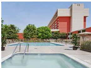
Ontario Airport Hotel & Convention Center, Ontario, CA

The beautiful Ontario Airport Hotel & Convention Center, located 50 miles east of Los Angeles, provided a venue, accommodations, and service, commensurate with a national organization's professional, educational, and hosting needs.